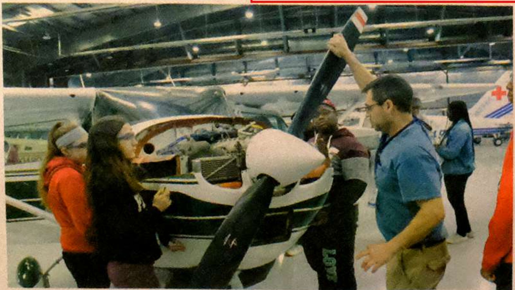
Students learn about STEM through aviation at Wings of Hope.