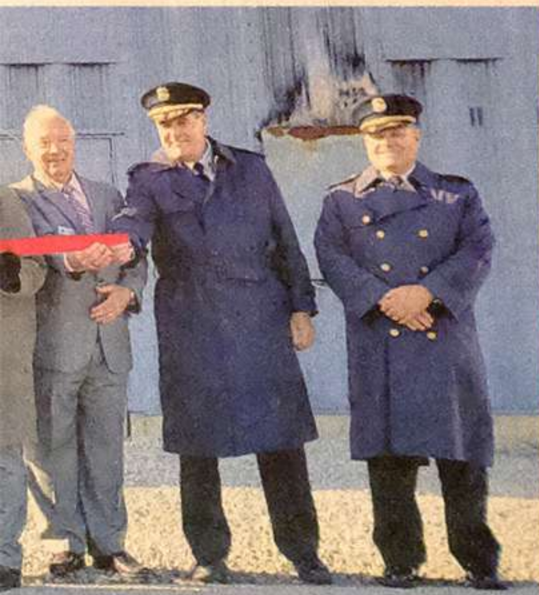
Monarch Fire Protection District

"As a pilot, I understand the value of programs that engage students in this way. It is incredibly rewarding to see students who