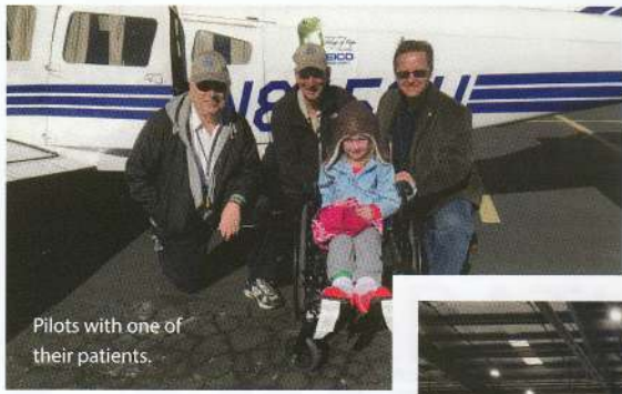
Pilots with one of their patients.