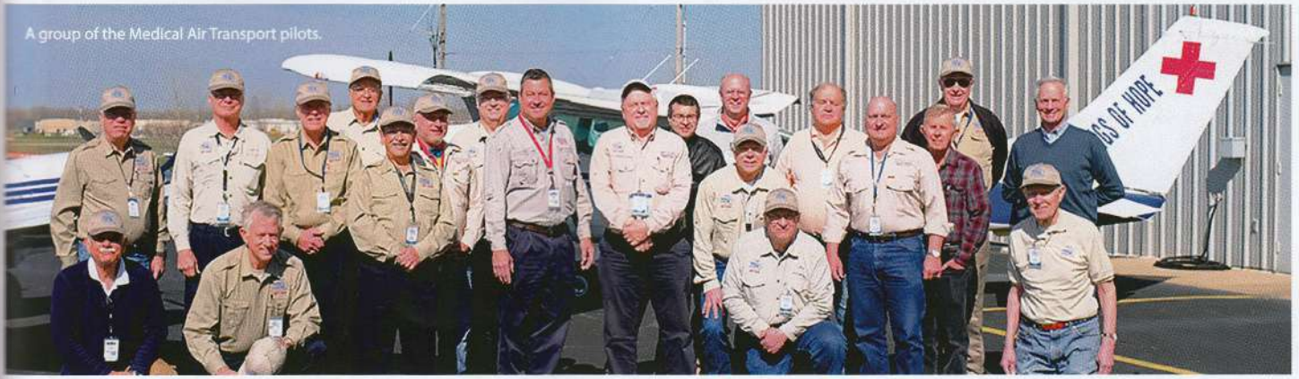
A group of the Medical Air Transport pilots.

WOH also partners with offshore medical air transport entities in Belize, Nicaragua, Columbia, Paraguay, Zambia, Tanzania, India, Cambodia, and Ecuador; providing aircraft, parts and maintenance services for medevac and fly-in clinics. They have also launched a Soar into STEM program domestically to encourage students excited about STEM learning and future aircraft careers.