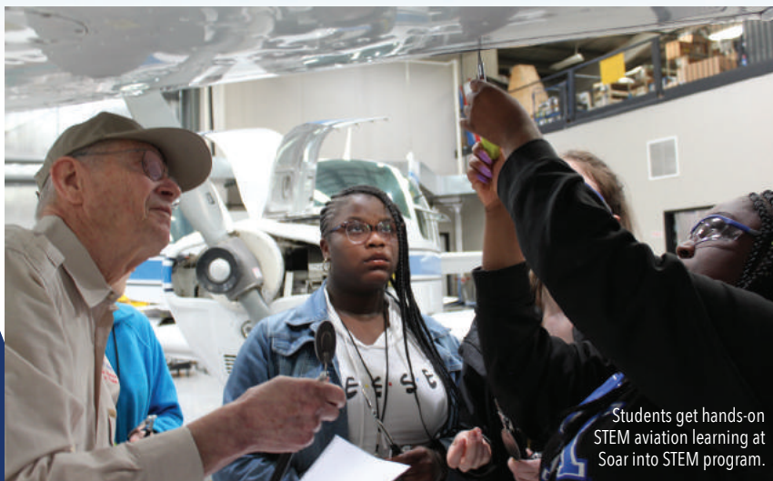
Students get hands-on STEM aviation learning at Soar into STEM program.